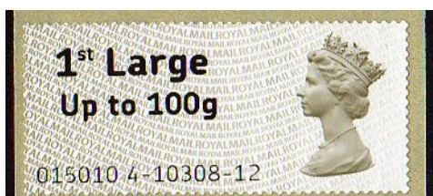
Original type: Wincor-Nixdorf - Type I