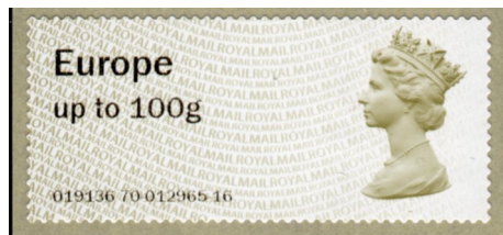
New machines: NCR - Type IIA